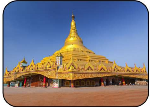
Global Vipassana Pagoda