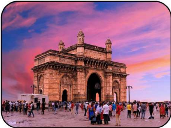
Gateway of India